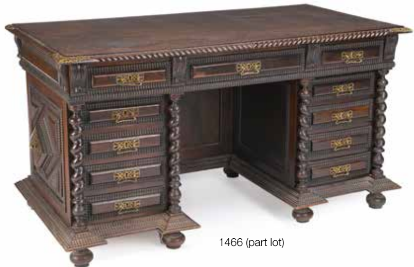
1466 (part lot)

Purchased by the owner's grandfather, a renowned professor at the University of Lisbon.