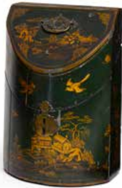
Lot 1042: "This stately pair of boxes add just the right touch of elegance to any room."