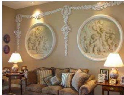
1091: paintings and swags shown in situ