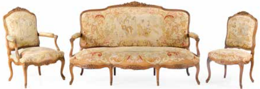
1144 (part lot)