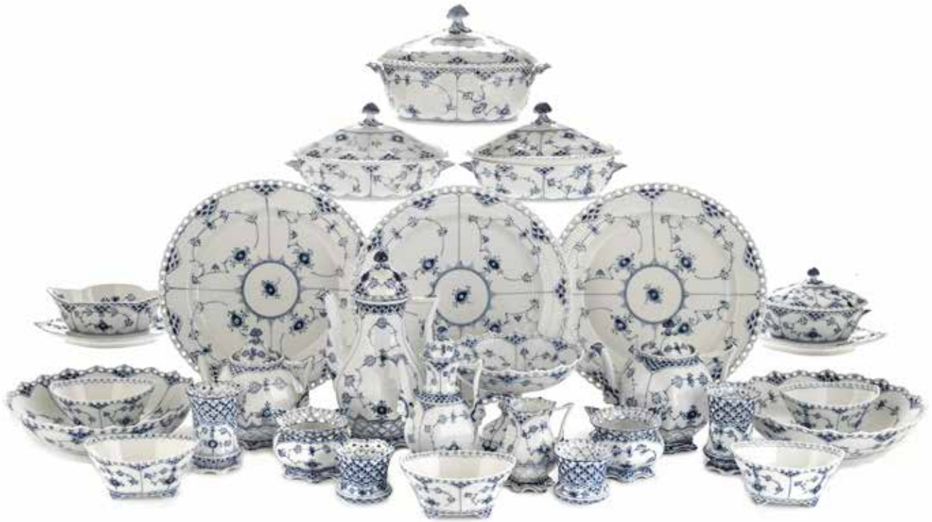
1587 (part lot)