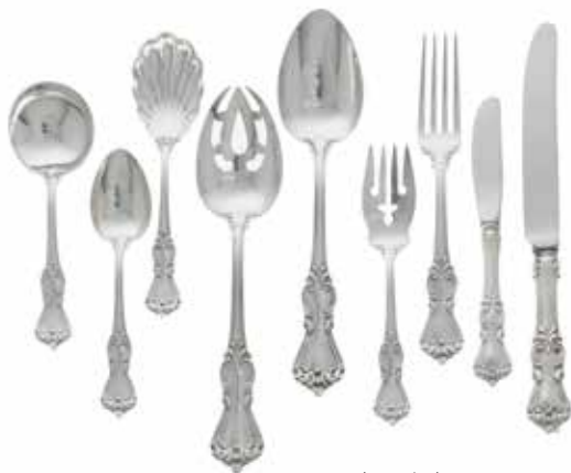
1013 (part lot)