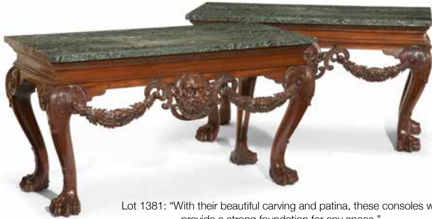
Lot 1381: "With their beautiful carving and patina, these consoles will provide a strong foundation for any space."