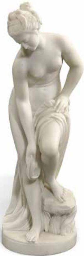
1534 (part lot)