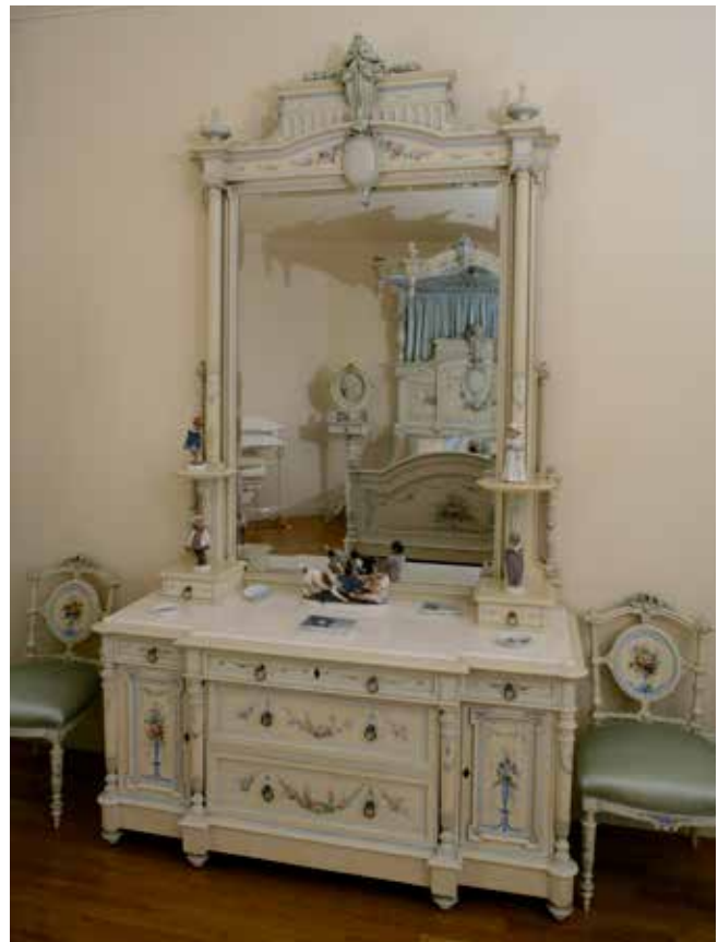
1455, photograph courtesy of Douglas Sandberg Photography