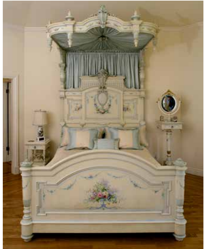
1455