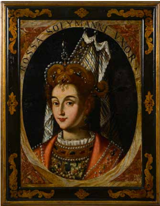
1241 (part lot)