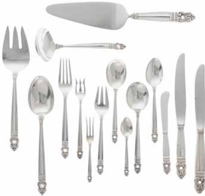
1017 (part lot)

1017 AN AMERICAN STERLING SILVER FLATWARE SERVICE BY INTERNATIONAL SILVER CO., MERIDEN, CT, 20TH CENTURY