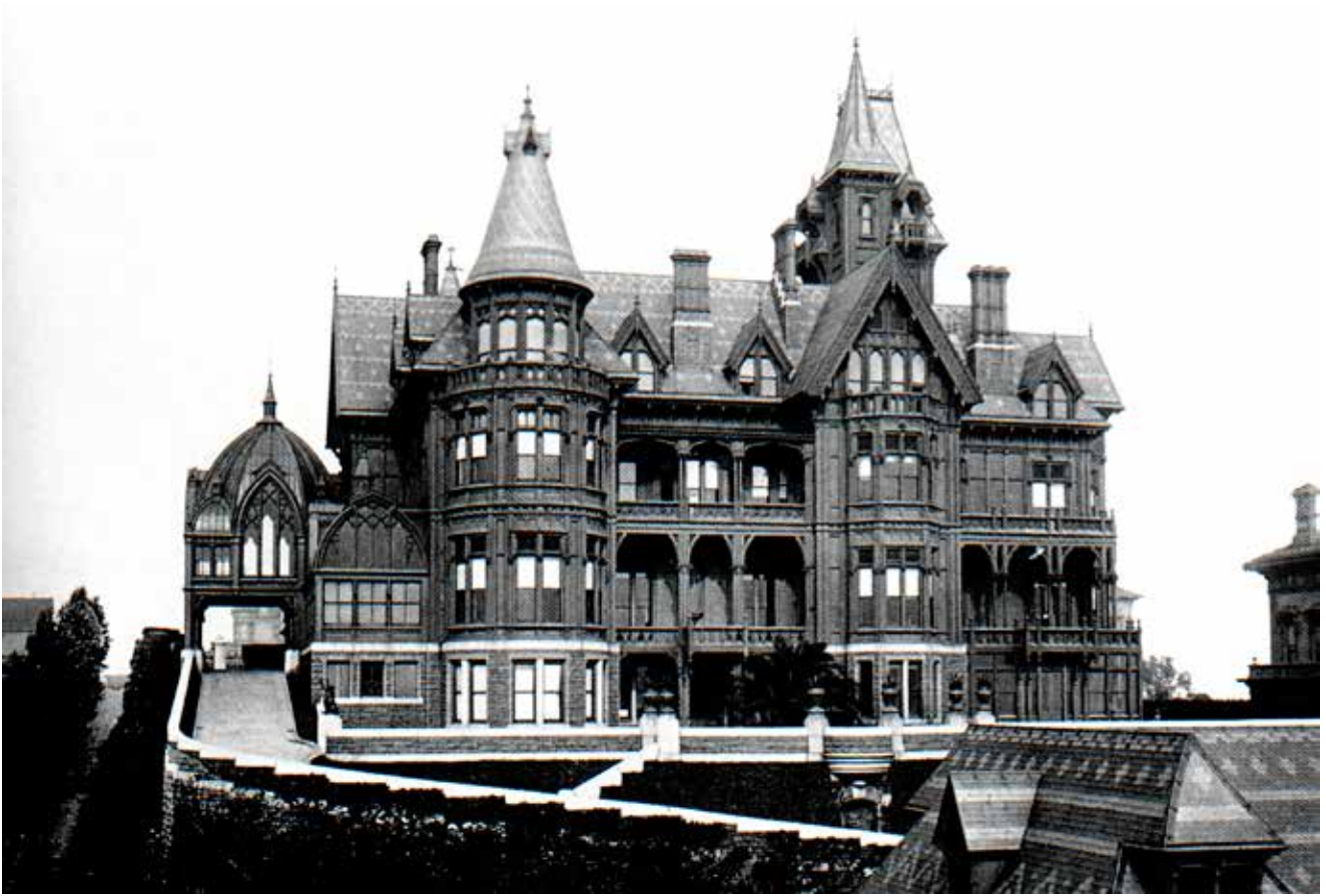
Rear view of the Mark Hopkins San Francisco residence.

Mark Hopkins (1813-1878), treasurer of the Southern Pacific Railroad, purchased property at the corner of California and Mason Streets in San Francisco from his former friend, Leland Stanford. Following Mrs. Hopkins' wishes, the architectural firm of Wright and Saunders was retained to design the thirty-four room Gothic mansion. Work began on the house in 1875 and was completed in November of 1878, nine months after the death of Mark Hopkins.