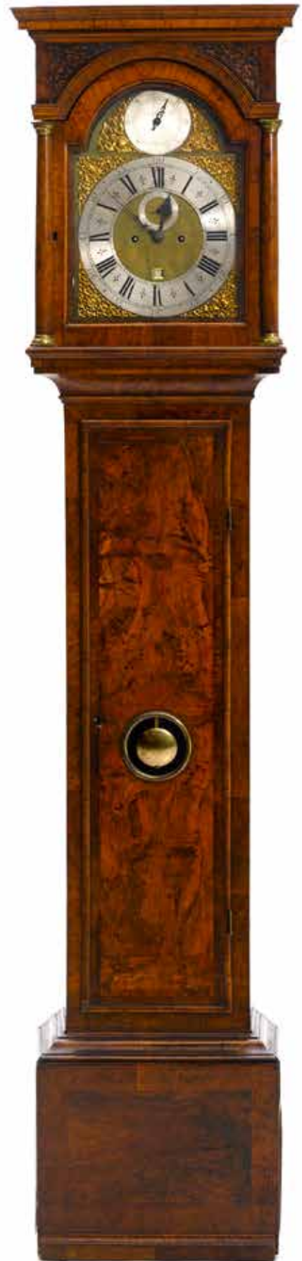
1346 A GEORGE II BURL WALNUT TALLCASE CLOCK JOHN ELLICOTT, LONDON SECOND QUARTER 18TH CENTURY The twelve inch arched brass dial with silvered chapter ring, subsidiary seconds dial and date aperture with strike/silent dial to the arch, inscribed John Ellicott London. height 88 1/2in (225cm); width 18 1/2in (47cm); depth 10 1/4in (26cm) $7,000 - 10,000