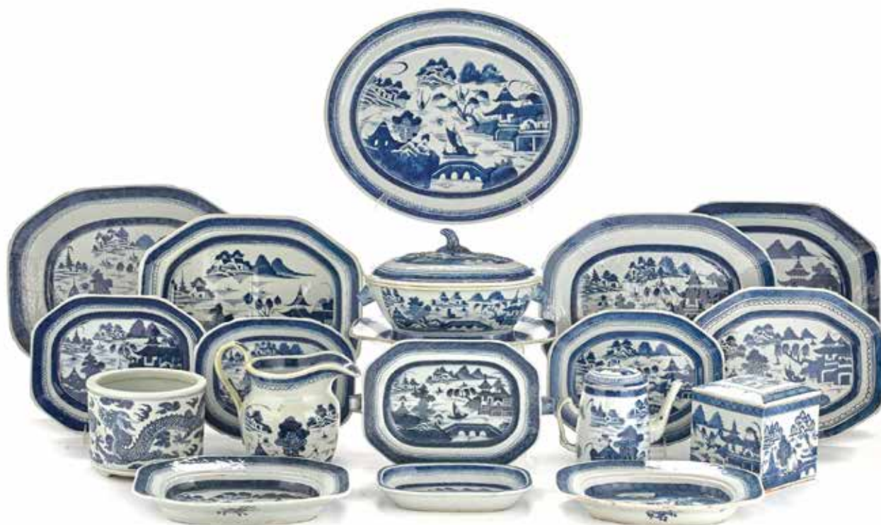
1564 (part lot)