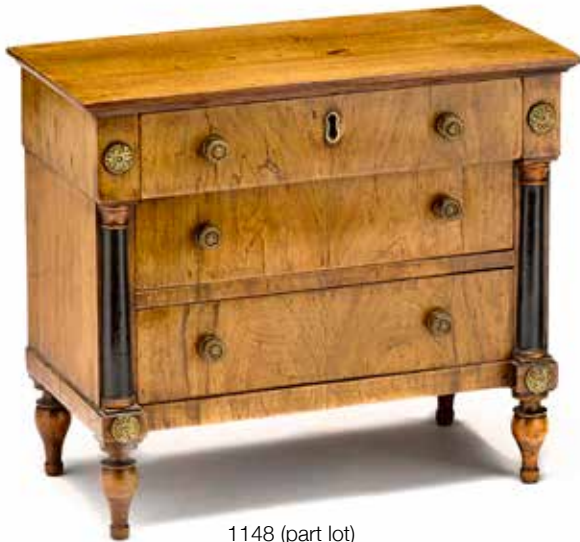
1148 (part lot)