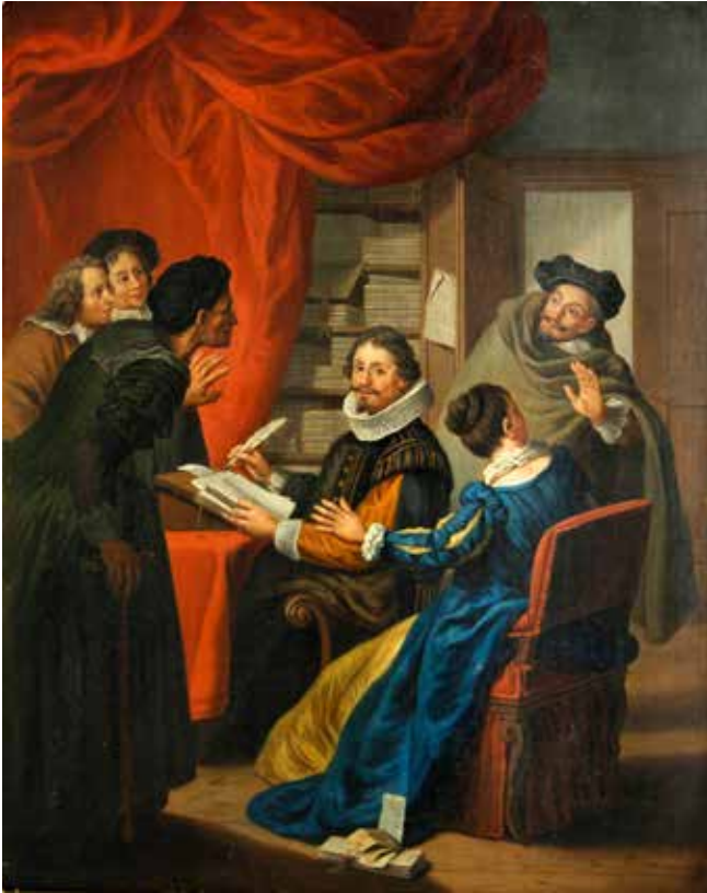
1134 (part lot)