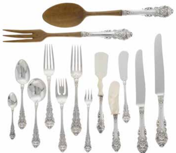
1015 (part lot)