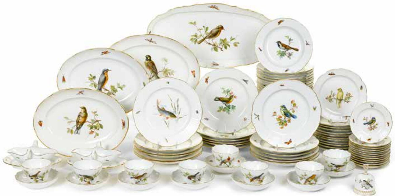
1565 (part lot)