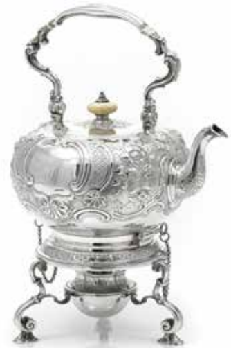
Lot 1004: "A symbol of the grand tradition of afternoon tea, this kettle would make a fabulous addition to a silver collection."